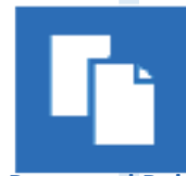
Paper and Pulp