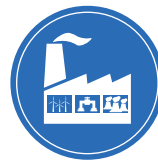
Various Industrial Applications

Following material configurations are available: