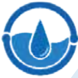
Water and Sewage, Desalination