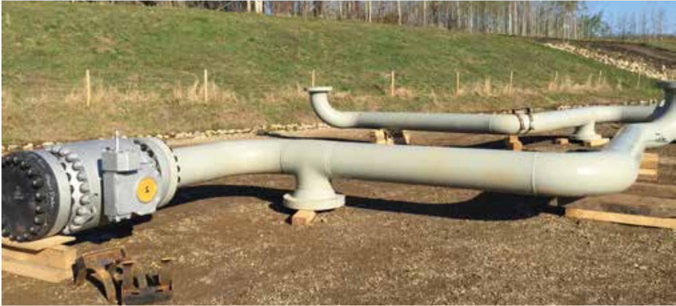
Installation at British Columbia, Canada